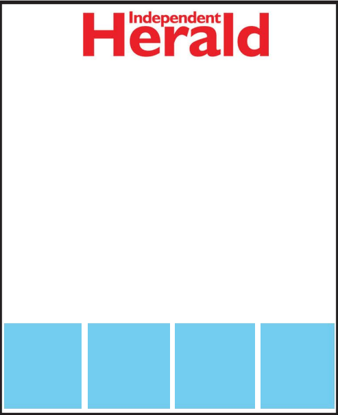
FRONT PAGE advert 7cm x 8 cols (70mm x 50mm wide) $290.00 + GST