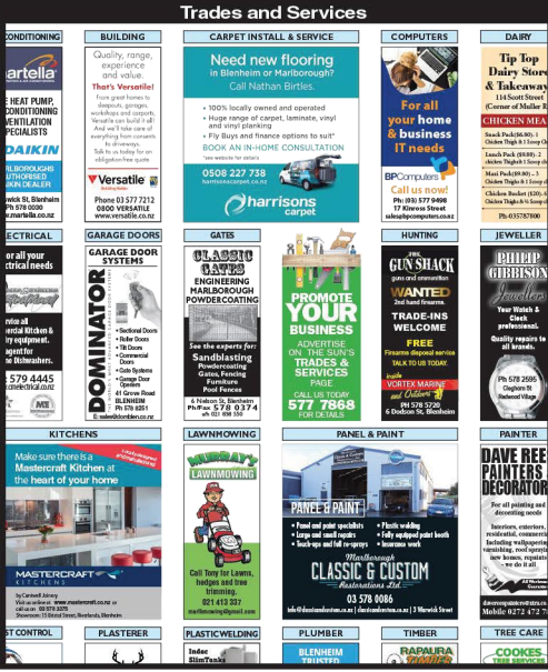
TRADES & SERVICE Page 8x1 (80mm x 32mm wide) $39+gst (minimum 3 mths)