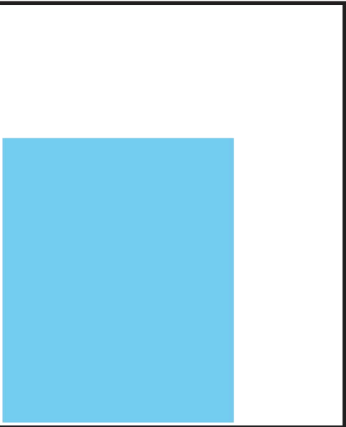
HALF PAGE (vertical, mini full page) 28cm x 5 cols (280mm x 160mm wide) $900.00 + GST