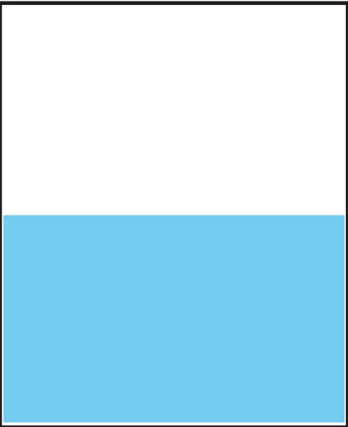
HALF PAGE (horizontal) 18cm x 8 cols (180mm x 260mm wide) $900.00 + GST