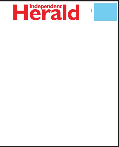
FRONT PAGE Lug 4x1 (40mm x 40mm wide) $180.00 + GST